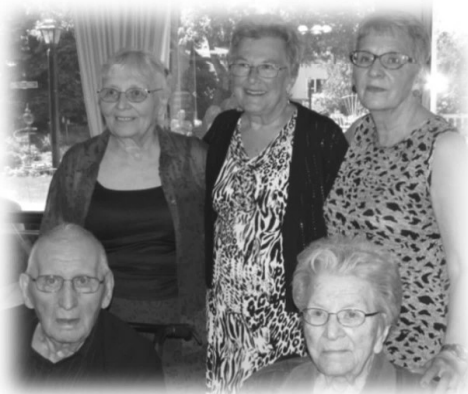
Lil & Art also recently celebrated their 75th Wedding anniversary in June!