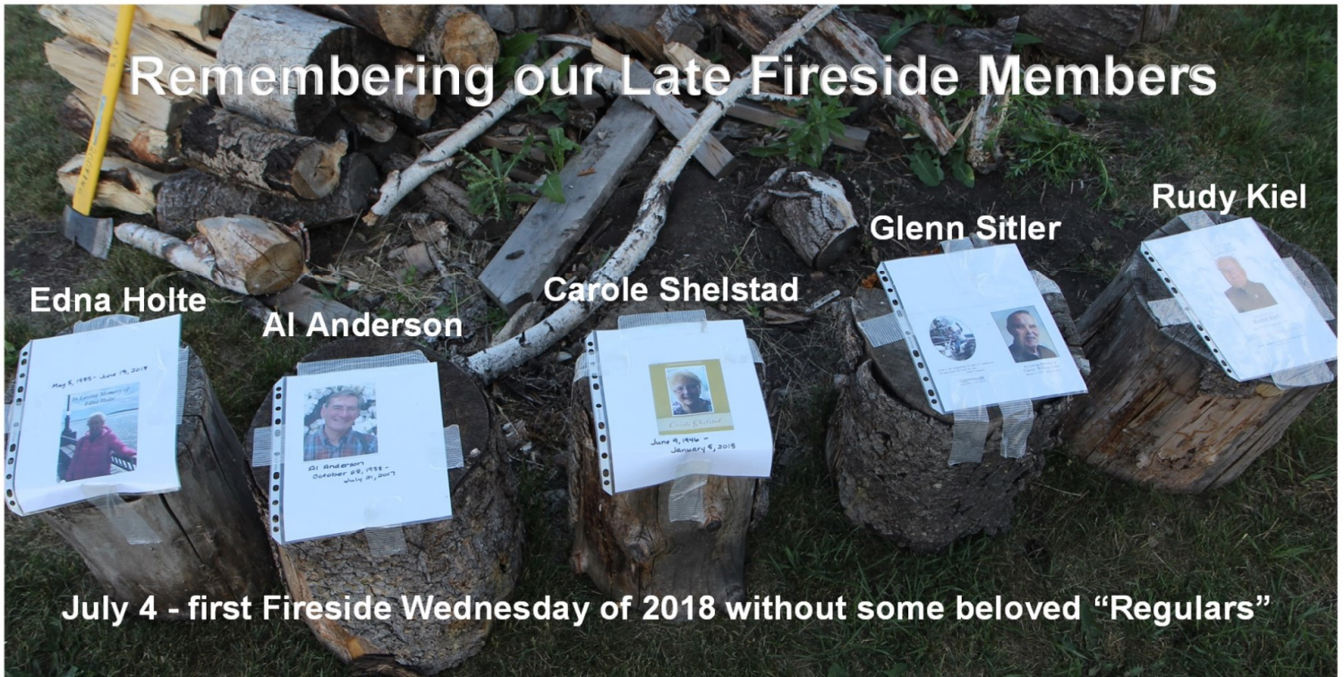
July 4 - first Fireside Wednesday of 2018 without some beloved "Regulars"