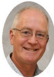
Lynn Spain Property property @glorylutheran.ca